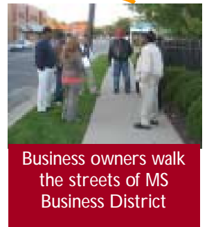
Business owners walk the streets of MS Business District

The designation of a Corridor Improvement District (CID) in Madison Square is well on its way. The CID will use tax-increment financing to capture a portion of property taxes to improve the business district. On Oct. 9th, area business owners and residents conducted a walking audit of the district to gather preliminary ideas for the future CID. Additionally, the South East Community Association (SECA) and Calvin College, Urban Economic students surveyed residents and business owners throughout Madison Square for input.